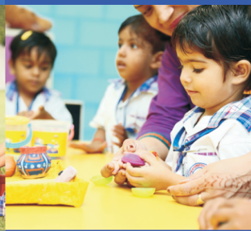
SCULPTURE & POTTERY