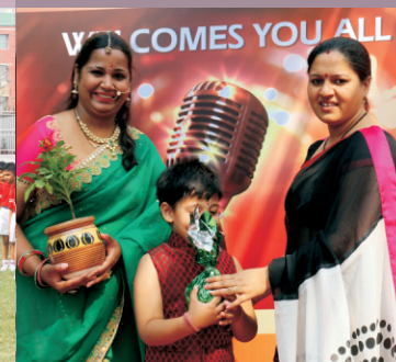
AWARDS & CERTIFICATES