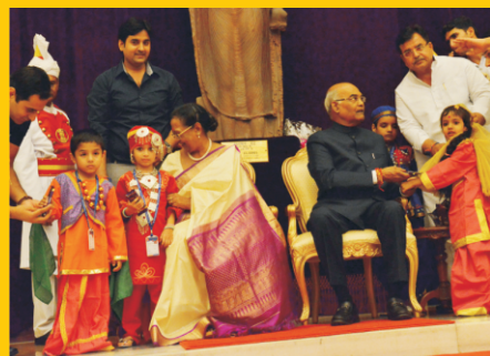
A GREAT DAY WITH THE PM Exposure with WHO is WHO