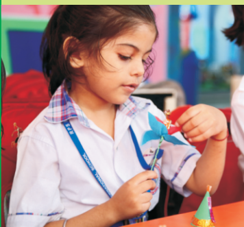
DRAWING & CRAFT