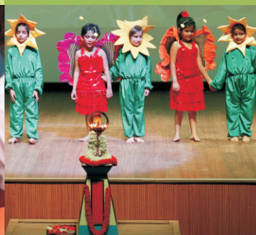
MUSIC & DANCE